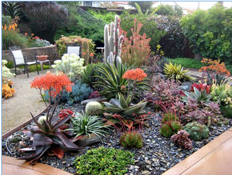
Figure 4. A 3-inch layer of wood chip mulch conserves water, reduces weeds and water runoff.

Avoid overfertilizing. Applying too much nitrogen leads to an overabundance of foliar (leaf) production and the need for more water. Most mature landscape plants will get through a season or two with no supplemental fertilizations. Fruit trees and vegetables require adequate nutrients for crop production. When water is scarce fruit trees should not be fertilized; while the crop may be sacrificed, this practice reduces water requirement and will help keep the tree alive. Annual vegetables may get by on slow release nutrients supplied by organic matter and compost.