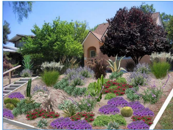
Figure 6. Beautiful, drought-efficient landscapes save water and time and reduce erosion and runoff.