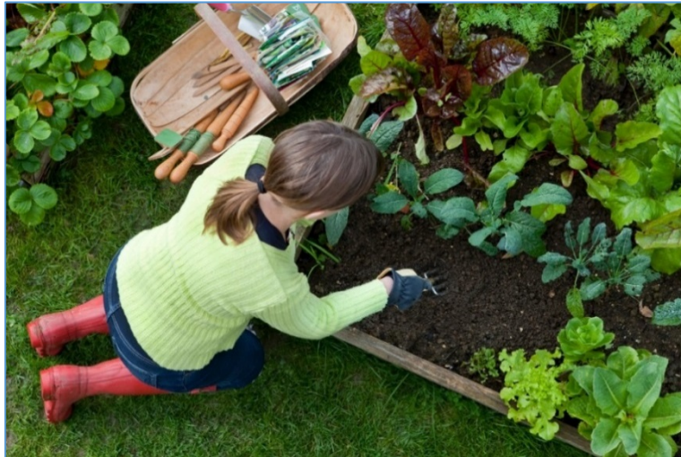
Figure 5. Plant only family favorites and avoid an oversized garden that is larger than your needs.

Vegetables: Vegetables are not drought efficient plants and are difficult to maintain during a drought. It is often wise to reduce the overall size of the garden and plant only your favorite types of vegetables when water is limited. Scheduling irrigations based on the water needs of the specific crop during critical periods of growth is essential for vegetable production. Hydrozoning (placing plants with similar water needs in the same area of the garden) allows gardeners using automated drip irrigation systems to target water applications based on water needs of individual zones, reducing water waste.