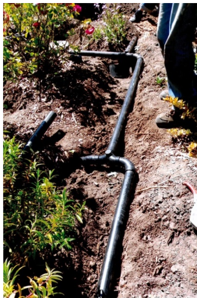
Example of a ‘branched drain’ graywater system relying on gravity.

‘Branched drain’ types (shown below) of graywater systems rely on gravity to distribute graywater to mulch basins. While often capturing graywater from showers, they can also be used in conjunction with washing machines as ‘laundry to landscape’ systems. They only work when plantings are located below the water source since they do not contain an external pump. ‘Branched drain’ systems are excellent methods of watering trees and shrubs. The final exiting point of each branch are trees and shrubs in mulch basins. While these systems are relatively maintenance-free and efficient once installed the installation process may be difficult and homeowners may want to hire an expert to install them. Like other ‘laundry to landscape’ systems, no filters need to be changed and no additional wiring or pumps are required and cleanouts can be incorporated for regular, easy flushing.