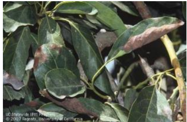
Leaf Blight in avocado. Notice the uneven marginal burn to distinguish it from “tip burn”. The necrosis can occur anywhere on the leaf without a pattern