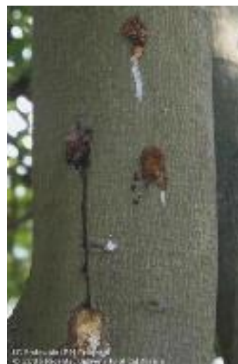
Bacterial canker in avocado