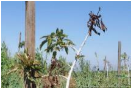
Asphyxiation from too much water