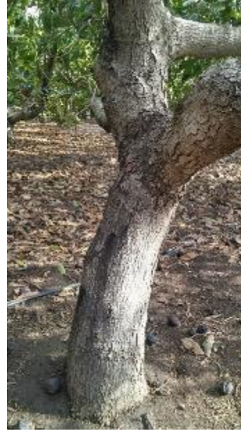
Black Streak in avocado

Drought and salt stress can also lead to increased incidence of some diseases. Some of these diseases are secondary pathogens and unless it is a young tree (under three years of age) or one blighted with a more aggressive disease, the disease condition is not fatal. Often times, in the best of years, on hilly ground these diseases might be seen where water pressure is lowest or there are broken or clogged emitters. The symptoms are many – leaf blights, cankers, dieback, gummosis – but they are all caused by decomposing fungi that are found in the decaying material found in orchards, especially in the naturally occurring avocado mulch or artificially mulched orchards. Many of these fungi are related Botryosphaerias , but we once lumped them all under the fungus Dothiorella . These decay fungi will go to all manner of plant species, from citrus to roses to Brazilian pepper. The good news is that, in many cases, once the drought and salt stress has been dealt with the disease symptoms slowly disappear.