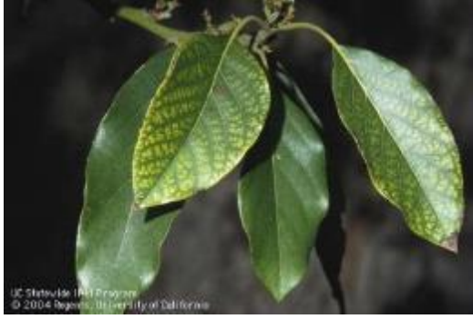
Incipient potassium deficiency from drought