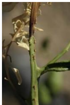
Citrus dieback. In young trees this can grow down to the graft and kill the tree

Another secondary pathogen that clears up as soon as the stress is relieved is bacterial canker in avocado. These ugly cankers form white crusted circles that ooze sap, but when the tree is healthy again, the cankers dry up with a little bark flap where the canker had been.