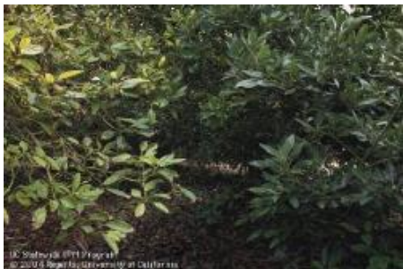
Phytophthora root rot on left from too much water