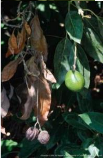
Salt and Pepper syndrome where large parts of the leaf stems dieback and the rest stays green