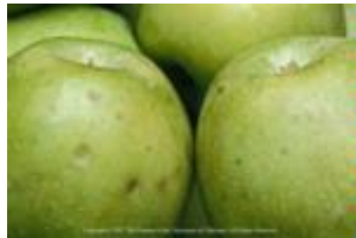
Bitter Pit of apple from low calcium

Salinity and drought stress can also lead to mineral deficiencies. This is either due to the lack of water movement carrying nutrients or to direct competition for nutrients. A common deficiency for drought stressed plants is nitrogen deficiency from lack of water entraining that nutrient into the plant.