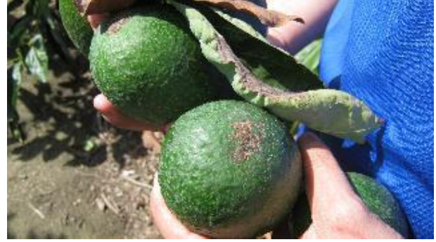
Botryosphaeria that has gone from leaves to fruit