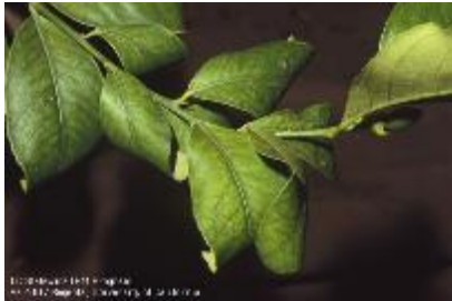
Curling leaves from lack of water

Too much or too little water can also predispose a plant to disease, e.g. Phytophthora root rot or asphyxiation from waterlogging or irrigations.