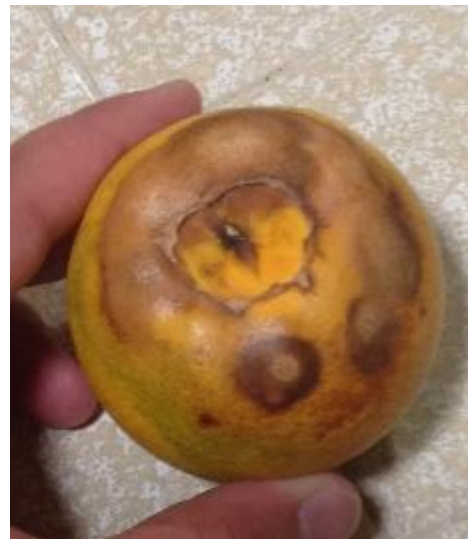
Blossom end rot in citrus

Nitrogen deficiency usually starts out in the older tissue and gradually spreads to the younger tissue in more advanced cases.