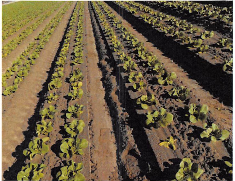
Figure 1. Strong winds cause yellowing and collapsing of some romaine lettuce plants.

Soon after the winds blow through a field, the grower may observe a collapse of plants. The plant population can be significantly reduced. Plants like in Figure 1 can be observed in a lettuce field a few days after experiencing strong winds. Here, young plants are collapsing; the symptoms observed include wilting, yellowing and stunting. When the plants are carefully dug out, a girdling or constriction of the main taproot can be observed. The girdling of the main taproot of lettuce is shown in Figure 2.