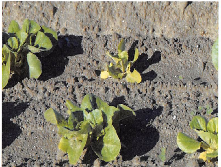
Figure 4. Healthy romaine lettuce plants next to stunted plant with root girdling.