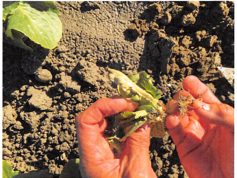
Figure 3. In some plants there is a complete girdling of main taproot from the plant

Wind Whip, Fusarium Wilt, Sclerotinia Drop, Verticillium Wilt and Ammonium Toxicity. These are all serious problems that can