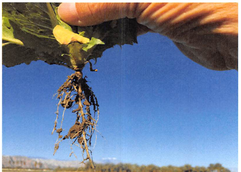
Figure 2. Girdling at the soil line is apparent when the young plants are carefully dug up.