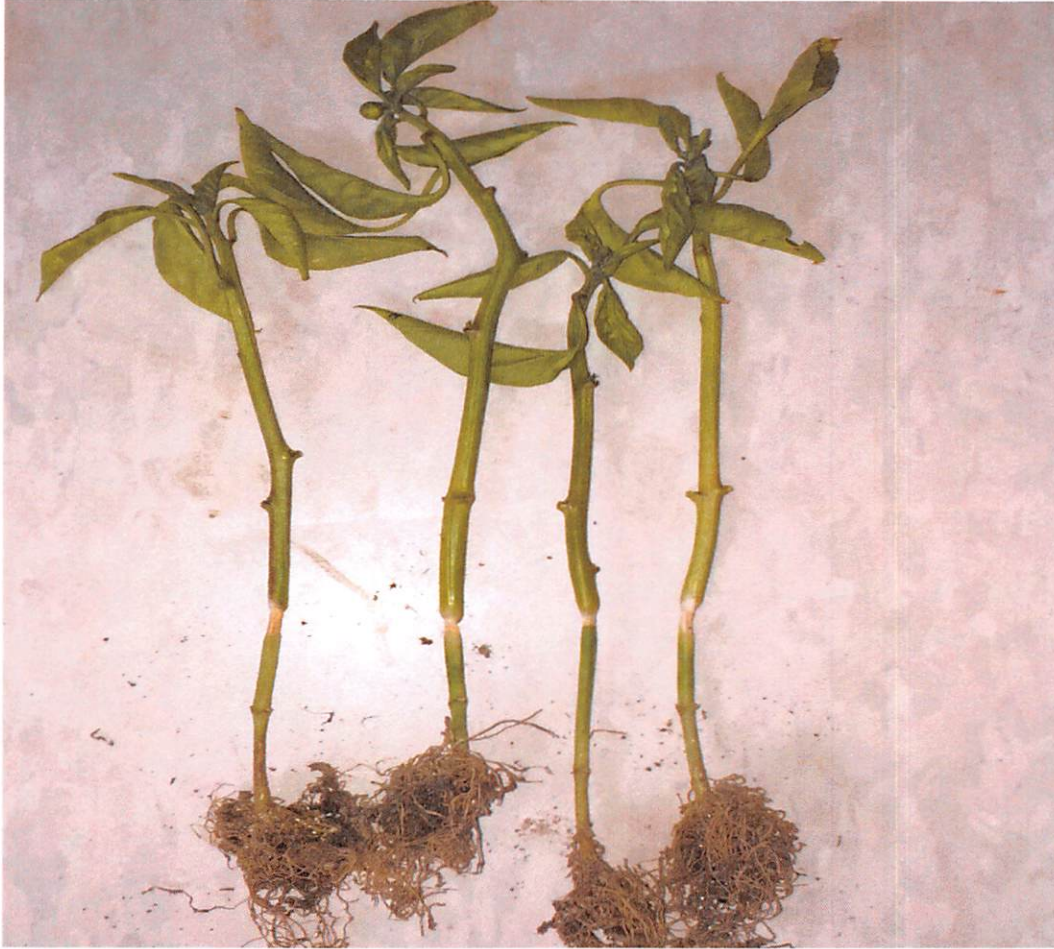
Figure 4. Bell pepper plants with stem scald symptom.

An article from the University of Florida titled “ Pepper Stem Scald: A Physiological Problem ” reports that stem scald can occur even in the absence of the plastic flap. The article also states that planting bell pepper before 9:00 a.m. or after 3:00 p.m., could adjust plant water usage and minimize stem girdling. Plants transplanted during the heat of the day were not able to adjust their water usage, resulting in “heat girdling”. The main point here is avoiding transplanting during hottest time of the day in order to minimize stem girdling problem. Stem girdling can also be affected by air and soil temperature, wind, and stem water potentials. The article was a report and they are repeating the experiment.