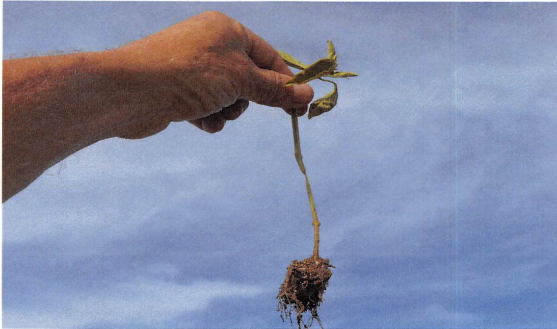
Figure 2. Collapsed bell pepper plant with girdling obvious well above the soil line.