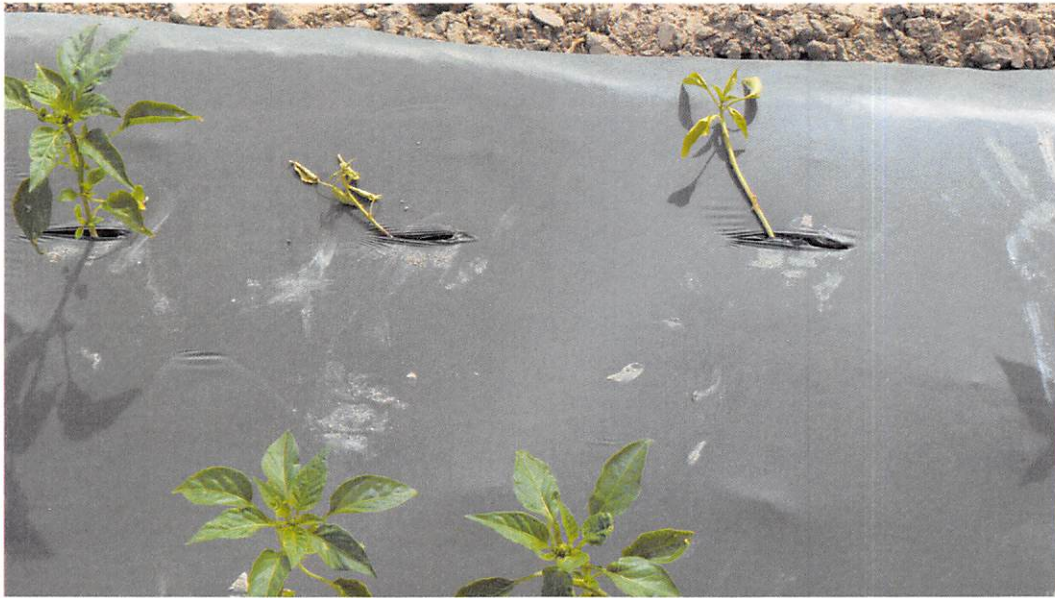
Figure 1: collapsing late spring planted bell pepper plants

Coachella Valley bell pepper growers at one time or another observe that recently transplanted plants randomly collapse (as shown in Figure 1) in the field. Seedling collapse and dieback occurs in late spring or early fall bell pepper plantings. Plant collapse can be extensive and requires growers to make replacement plantings, resulting in economic consequences.