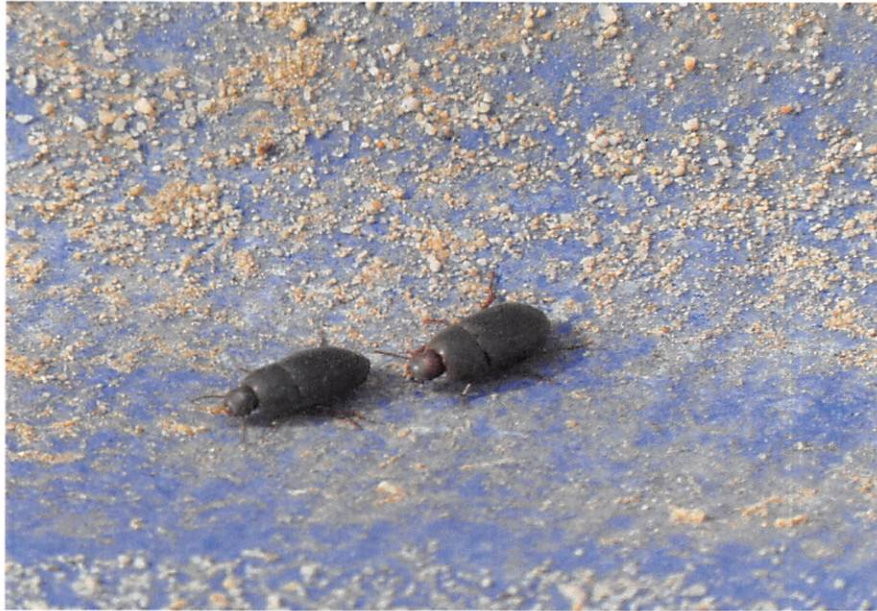
Figure 3. Darkling beetles migrating into a bell pepper field from a nearby field.

Darkling beetles feed on decomposing vegetation. If the darkling beetles have a food supply, the populations could buildup and eventually look for new food sources. To minimize darkling beetle problems in bell pepper fields therefore, the previous crop residues needs to be disked under and the organic material decomposed prior to transplanting bell pepper. Darkling beetles can be a problem on the very young and tender bell pepper plants. Once plants mature and the stem hardens and become woody, darkling beetle cannot be a problem.